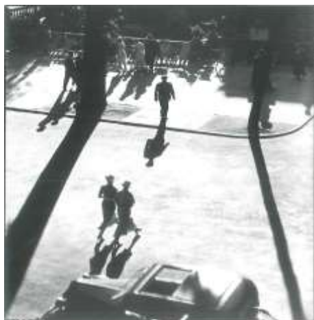
Cheltenham Promenade, 1935