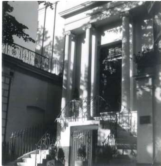
Belgrave House, Imperial Square, about 1950

Landscapes: Hugo's early landscape photographs followed a traditional 'pictorialist' approach, in which the photograph was intended to resemble an engraving or impressionist painting in black and white, using 'soft focus' or 'touching up' by hand to create the desired image. Hugo later rejected this approach in favour of a more direct 'photo realism', in which he let the camera, which he once described as 'an extension of the eye', speak for itself and record exactly what it saw. This resulted in many fine, almost abstract, photographs, including his evocative views of Cheltenham and the Cotswolds.