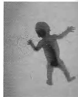
Front Cover: by Adam Fuss