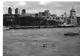
Front Cover: Standing figure on Buoy Stephen Balkenhol

Creative Camera is committed to equal opportunities and welcomes contributions from all who share our belief in the vitality of the art of photography.