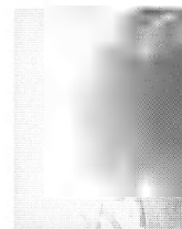
Front Cover: Self Portrait by Tomas

Creative Camera is committed to equal opportunities and welcomes contributions from all who share our belief in the vitality of the art of photography.