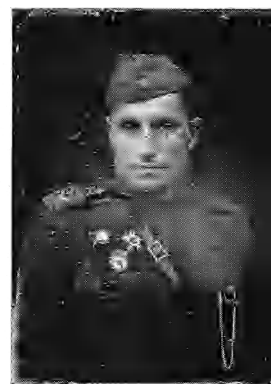
Front Cover:  (from the book Peaceful Action )

Creative Camera is committed to equal opportunities and welcomes contributions from all who share our belief in the vitality of the art of photography.