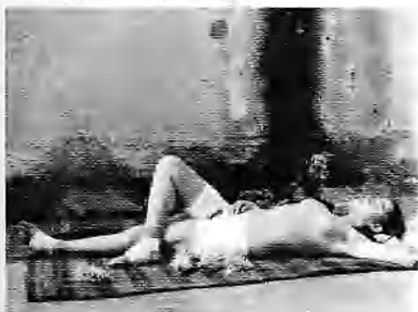
MANUEL ALVAREZ BRAVO