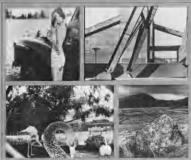
Formerly Creative Camera International Yearbook